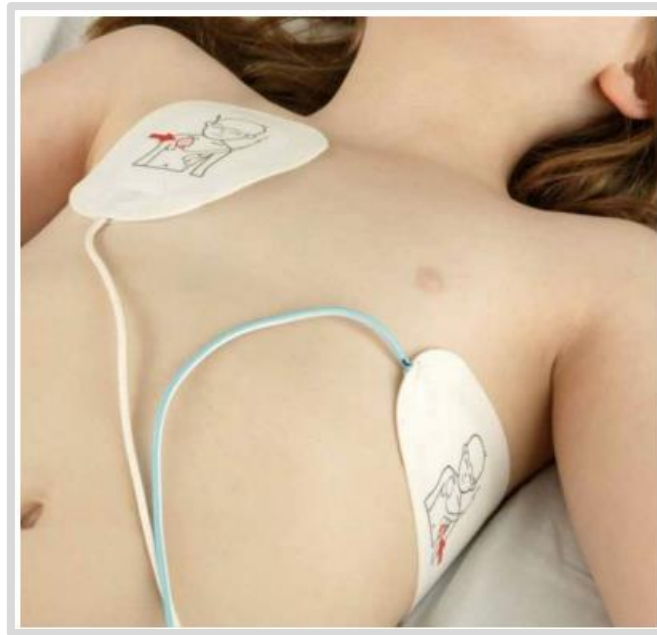
Figure 4: Example 1 – paediatric defibrillator pad placement (for use on children aged up to 8 years of age or weighing under 25 kg)