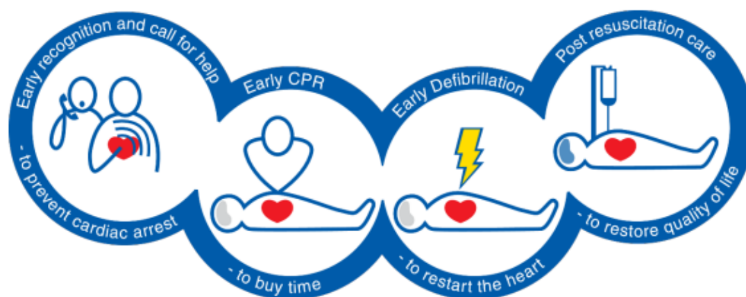
Figure 2: The Chain of Survival

In the event of a cardiac arrest, defibrillation can help save lives. To be effective, it should be delivered as part of the chain of survival.