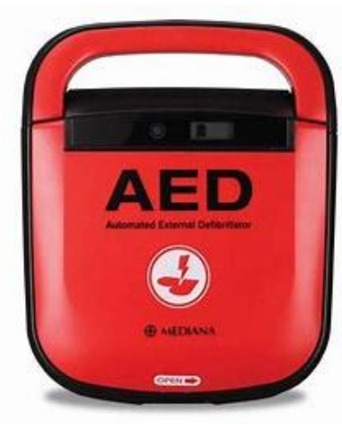
Figure 1: An AED

Please be assured that modern defibrillators are simple and safe to operate and use. Once attached, the defibrillator will automatically analyse the individual's heart rhythm and, if required, apply a shock to restart it or advise that CPR should be continued.